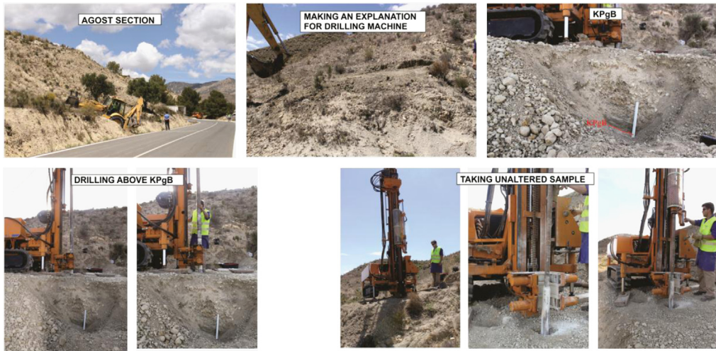
Fig. 1. Photographs of the Agost site, during the drilling and unaltered sampling.

specifically, 544 data points in the gray calcareous marlstones and marlstones from the uppermost Maastrichtian, and 3570 data points from the lowermost Danian sediments. Among the latter, 255 data points were taken in the ejecta layer, 1827 data points in the boundary clay layer and 1488 data points in the light marly limestones ( Excel file 1 from Supplementary material ). In turn, the ICP-OES profiles include only 31 data points in a 21.50 cm studied interval, four of which correspond to the gray calcareous marlstones and marlstones from the uppermost Maastrichtian and 27 to the lowermost Danian sediments. Of these 27, three data points were taken in the ejecta layer, 16 in the boundary clay layer and 8 data points in the light marly limestones ( Table 1 ).