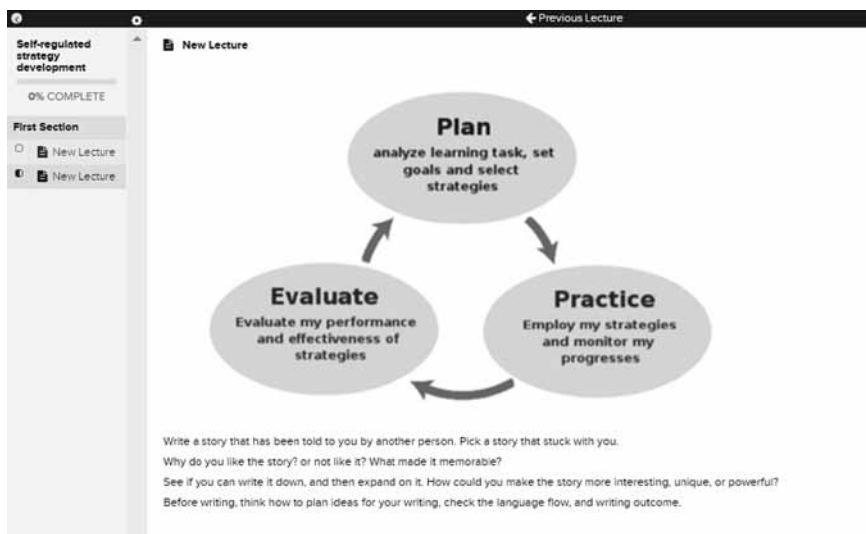
Figure 2. Screenshot of SRSD instruction