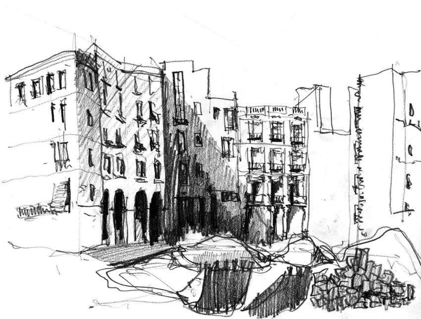
Sketch of demolitions for a new square under in La Ribera district, 2014.