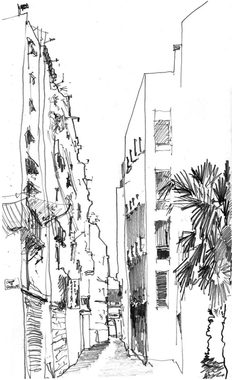
Sketch of Santa Caterina Market and new housing seen from a side street, 2014.