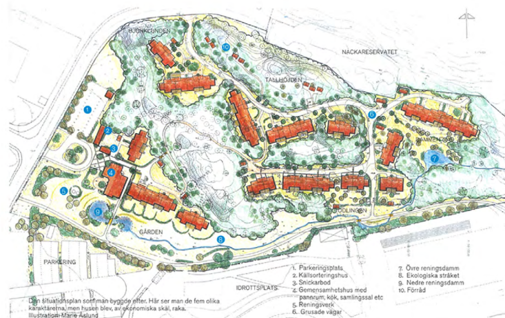
Figure 4: Final urban design plan. Understenshöjden (1989-1995), Stockholm