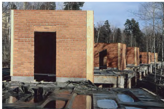
Figure 5: Bathroom nucleus built with brick walls. Understenshöjden (1989-1995)