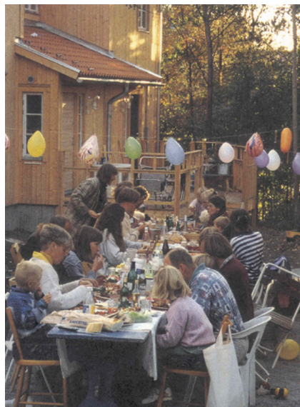
Figure 2: Colective celebration in Understenshöjden, Stockholm Source: HSB Stockholm. The Story of Understenshöjden (Stockholm: HSB Stockholm, 1997)

In such a way EBBA was a special case, although the anti-speculative condition is not completely implemented and they act as an ‘attachment’ to HBS, this small-scale community benefited from an ample and strong autonomy already from its very starting point. Thus, inhabiting in a cooperative as Understenshöjden is understood as a political action of emancipation. Is the future community who instigated the real estate development outside any municipal or state planning as a search for a more ecological, democratic and affordable housing option. These ‘autonomous habitable action(s)’, as the British architect John Turner would define them, allow interesting innovations and produces impact both in the process and the final object.