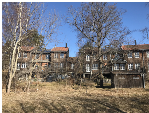
Figure 7: View of housing from the 'Ecological Path'. Understenshöjden (1989-1995)

This new role for the architect, dealing with so many factors and the contingency produced by the users implies a radical change on the planning paradigm.