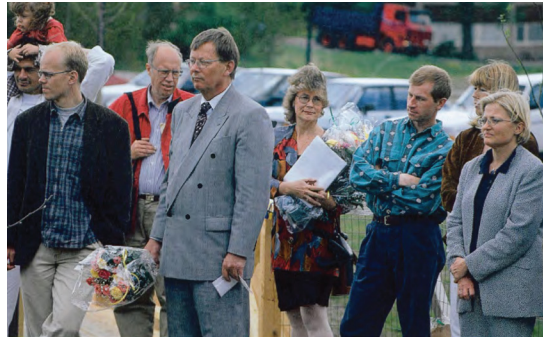
Figure 1: Image opening's event of Understenshöjden, May 1995, Stockholm

In May 1995, Anna Lindh, the well-known Swedish politician, 1 Minister for the Environmental Affairs at the time, attended the opening party of Understenshöjden's new district. Together with the director of HSB —the biggest cooperative association in Sweden— in Stockholm Ulrik Fällman and the whole community of EBBA —the Housing Association for Organic Living in Björkhagen 2 celebrated the culmination of a long process of housing production after six years from its beginning in 1989. Understenshöjden (literally translated as Under the height of the stone) was about to be labelled as the first eco-district in Stockholm. With 44 terraced homes distributed in 14 buildings, a common house for parties and meetings, a shared kitchen, a laundry, an office, a playroom, a wood workshop space and a second hand shared warehouse, the new neighborhood was built as a manifesto of a community-based way of living and the possibility of an ecological habitat in balance with environment.