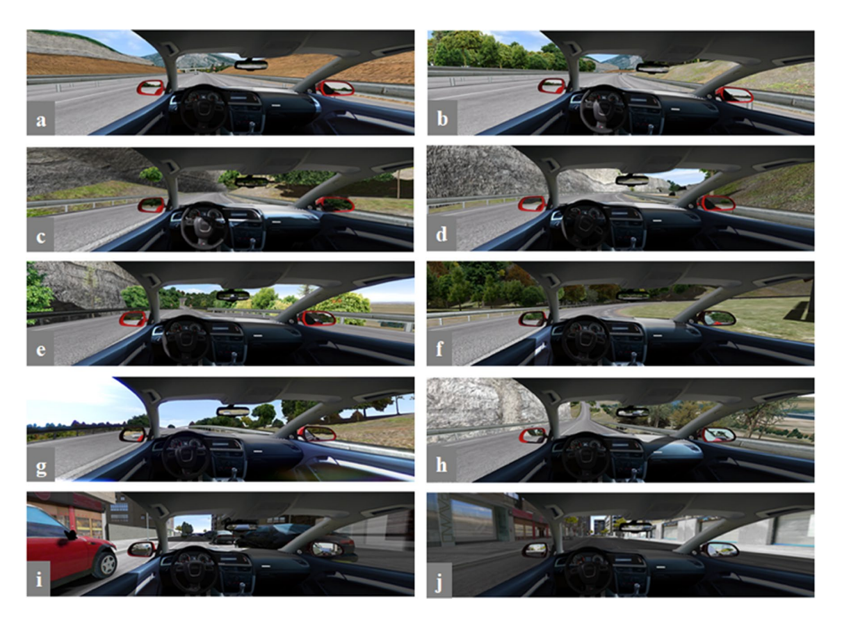
Figure 1. Screenshot of the different driving scenarios selected for the analysis (a-j correspond to scenarios 1–10).

the study analysed the drivers' behaviour on different road geometries using a generalised linear mixed model (GLMM) with repeated measures.