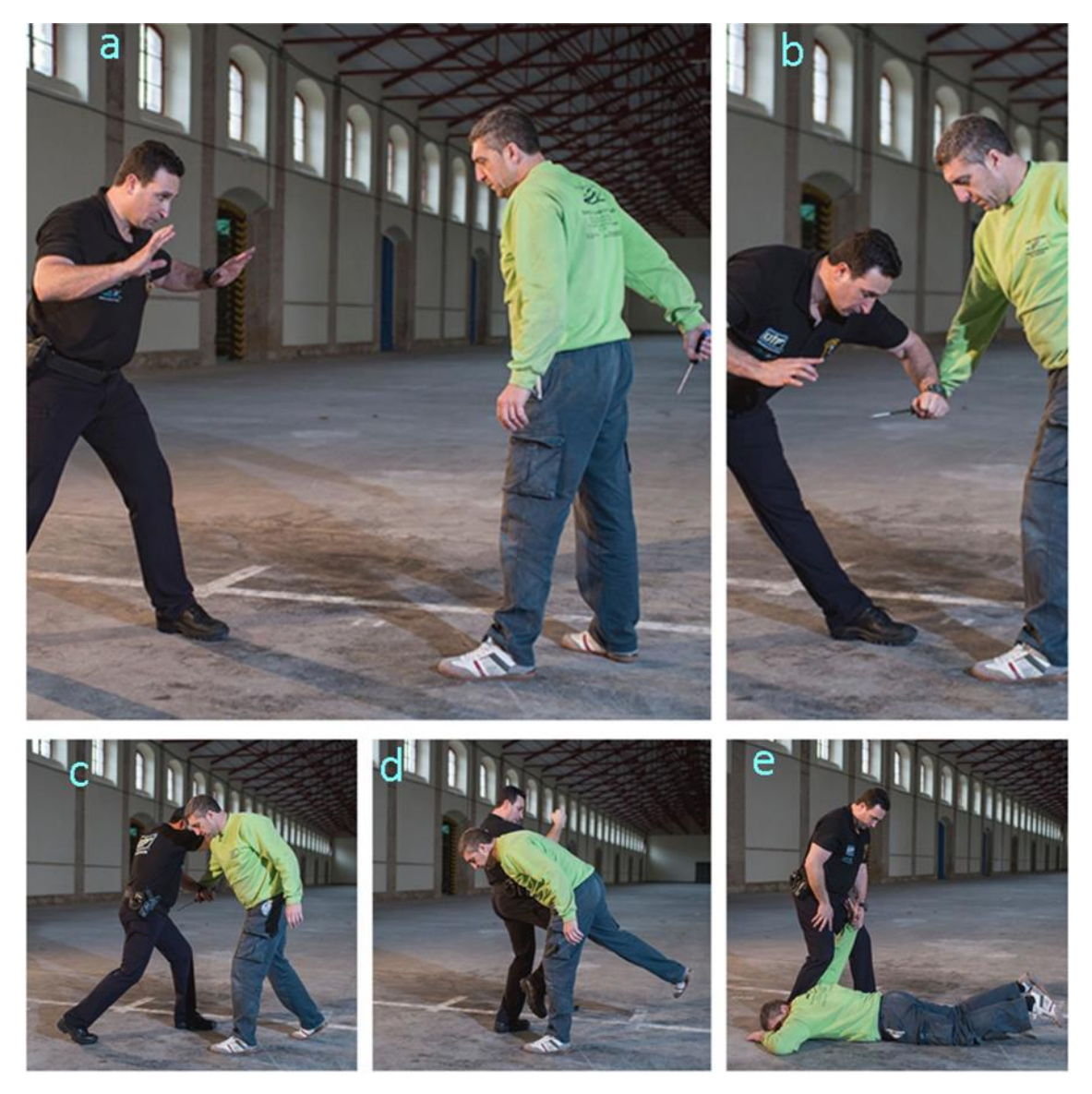
Figure 3. Steps of PIT 2 (response to a knife blow). (a) The officer faces the opponent holding a knife. (b) The officer uses one forearm to block the arm holding the knife. (c) The officer uses his free forearm to block the opponent's free elbow. (d) Once the opponent is controlled, his balance is broken by kneeing on the backward leg. (e) Subduing the opponent on the ground.

3.3.3. Technique 3. Response to a Blunt Object Blow