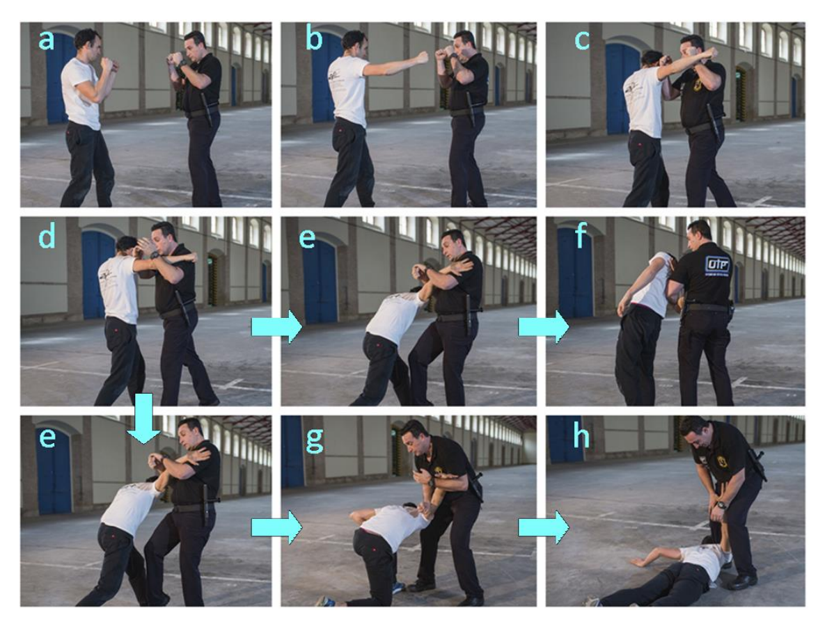
Figure 2. Steps of physical intervention techniques (PIT) 1 (response to a hooking punch). ( a ) The officer faces the opponent. ( b ) The opponent charges against the officer. ( c ) The officer with his forearms blocks the opponent's forward arm. ( d ) The officer releases the arm he previously used to block the opponent's arm. ( e ) The officer's previously released arm is used to grab the opponent break his balance with a knee blow on the opponent's backward leg. After this picture the arrows indicate the flow of motion between the officer and opponent. The latter can be subdued in two different ways (as are pictured in f or g-h). ( f ) While standing, the officer controls the opponent by using his forearm to exert strong pressure on the opponent's elbow. ( g ) The officer controls the opponent with the same forearm in order to lower it and keep it bent. ( h ) The officer continues to exert further pressure with the forearm to take the opponent to the ground.