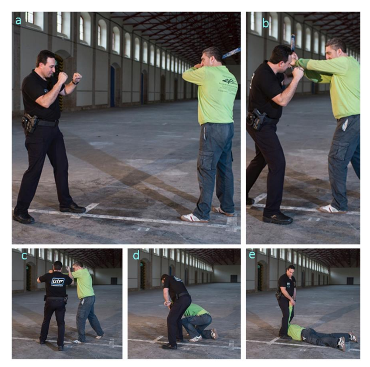
Figure 4. Steps of PIT 3 (response to a blunt object blow). (a) The officer faces the opponent holding a weapon. (b) The officer moves his left leg forward and uses his left forearm to block the opponent's blow. (c) While grabbing the opponent, the officer uses his right forearm to hit the opponent's elbow. (d) The officer uses his right forearm to exert pressure on the opponent's triceps. (e) The opponent is subdued on the ground similarly as with Techniques 2 and 3.

Officers applying Technique 2 or 3 should wear a padded sleeve for increased safety [Patent 1; ES2615602 (B2)] [55].