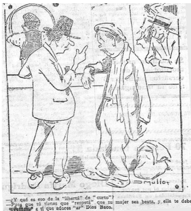
Image 3. Graphic section.

As Solomon (2003, p.48) points out, as with other aspects of anti-clerical ideology, the existing opinion about women was also transmitted through graphic representations in republican newspapers. Indeed, much of what has been analyzed above can be seen in the three images that, due to space limitations, we have selected from others and that we are going to analyze below to serve as a sample of this fact.