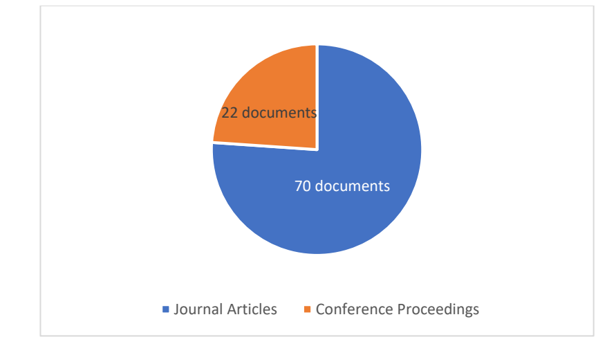
Figure 2 . Type of document collected.

Of the 92 documents collected, 70 articles were from peer-reviewed journals and 22 were from conference proceedings. With regard to journal publications, 44 journals had each published one item; the remainder had published 2 or more documents, as shown in Table 3. The journal International Review of Research in Open and Distributed Learning (IRRODL) published 9 articles, the highest number of documents.