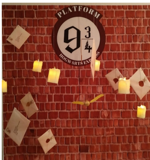
Figure 1. Letter of admission.

where a magic hat analyzes the personality and abilities of each student to assign them to one of the four houses into which the entire school is divided (Figure 1).