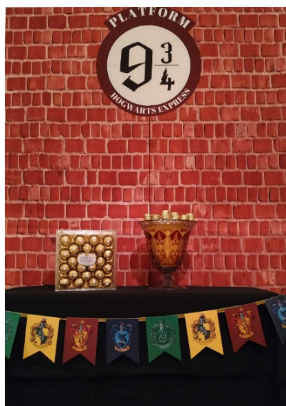
Figure 3. House Cup.

school supplies, included the symbol of one of the houses. Thus, when the leader selected a letter of admission, he was choosing, in parallel, the house that would correspond to his team.