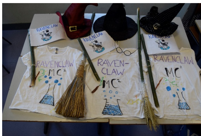
Figure 2. Ravenclaw team.

These houses bear the surname of one of the founders of the institution, and are represented by their own colours and symbols. To wit, the Gryffindor house, represented by a lion, is characterized by scarlet and gold; in the case of the Hufflepuff house, we find a badger, under the colors black and yellow; on the part of the Ravenclaw house (Figure 2), we appreciate an eagle, with the colors blue and bronze; and, finally, the Slytherin house, is symbolized by a snake, and its colors are green and silver.