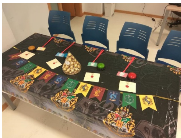
Figure 4. Activity Avada Kedavra.

For the development of this game, we gathered four desks that were decorated with a tablecloth with Hogwarts motifs (Figure 4).