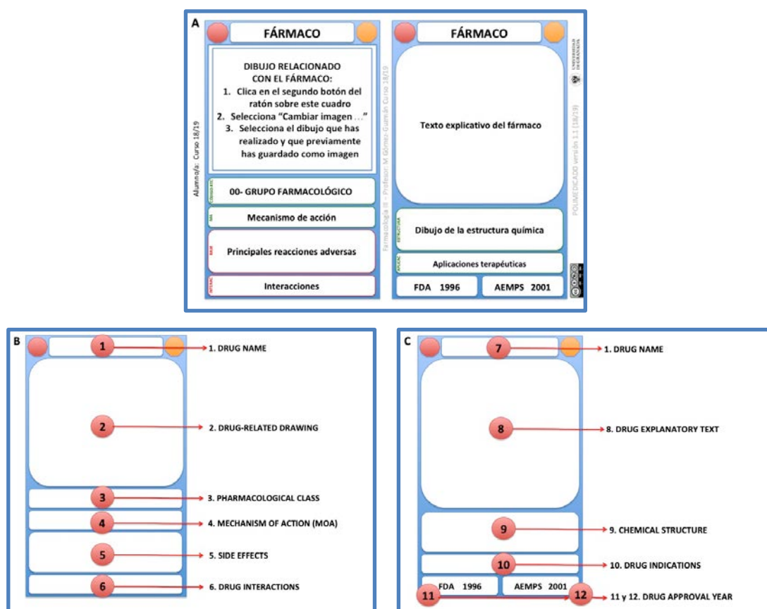
Figure 1. Template to elaborate the flashcards by the students. A. Front and back of the PowerPoint template that students will use to create the flashcards (text in Spanish). B and C. Front and back of the cards indicating the different sections that students must complete.

As a result of this analysis, we specified the design of the memorization cards and the main sections to be discussed in them were determined (Fig. 1). As it is shown in Fig. 1, a typical concept/definition or question/answer flashcard has not been devised. Our flashcards are more similar to the cards used in the “deck builders” type board games in which characters with their names and fighting characteristics appear. In our case, it is necessary for the student must look for the concepts requested in each section in different reliable sources of information. In most cases, it is not enough to look for the information in a single Pharmacology book. They will need to use several books as well as medical bibliographic sources.