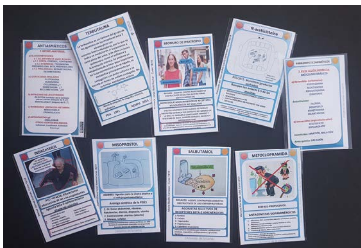
Figure 2. Flashcards printed on paper prepared by Pharmacology III students during the 2018/2019 academic year.

The study of the information will consist of stating the definitions and data. When all the cards of all the drugs that the student should study are available, we will create a deck with all of them and we will put a blank card at the beginning. The second card in the deck will be already a drug card. This card will be poked from behind until its name is revealed. With the help of the first card, the different sections of that drug can be said. If the student say it correctly, we take that card out of the deck, and if not, it is put to the end until it is learned (Fig. 3). This allows a self-learning in which each student establishes their times according to their memory abilities.