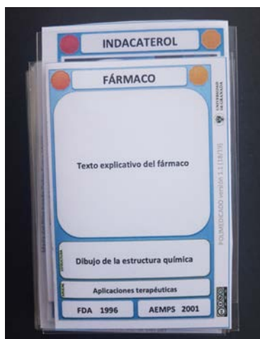
Figure 3. Flashcard Deck in which the template card covers the other cards, so the student can check whether or not he knows the information of the drug.

The study of the information will consist of stating the definitions and data. When all the cards of all the drugs that the student should study are available, we will create a deck with all of them and we will put a blank card at the beginning. The second card in the deck will be already a drug card. This card will be poked from behind until its name is revealed. With the help of the first card, the different sections of that drug can be said. If the student say it correctly, we take that card out of the deck, and if not, it is put to the end until it is learned (Fig. 3). This allows a self-learning in which each student establishes their times according to their memory abilities.