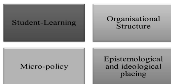
Figure 2. Cluster analysis.

As a result from the conceptual map, it can be seen that the principals work together in order to ensure that other members assume responsibilities in the teaching and learning processes and are involved in achieving the educational goals established by the school. Also, cluster analysis was carried out, which grouped the previously established categories into four macrocategories: Student Learning, Organizational Structure, Micropolicy and Epistemological and Ideological Placing (Figure 2).