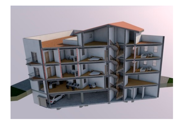
Figure 1. Overview of the building information model (BIM) of the considered use case.