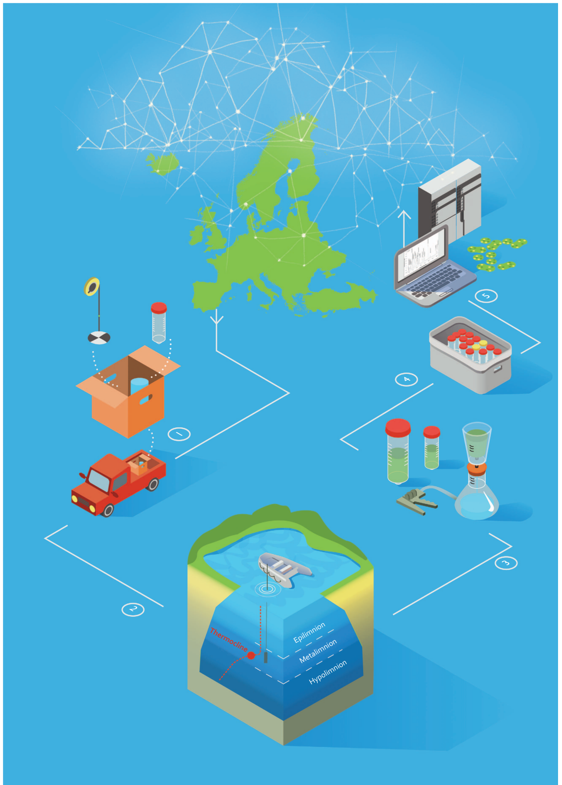
Figure 2. Schematic overview of the European Multi Lake Survey (EMLS). CyanoCOST and NETLAKE members performed the sampling routine by: 1. Preparing the sampling material to meet the standardized procedures 2. Accessing the lake site and acquiring integrated water samples from the bottom of the thermocline up to the water surface 3. Processing and preserving the water samples based on requirements for subsequent analysis 4. Shipping samples to a central receiving laboratory 5. Analysing nutrient, pigment and toxin concentrations in dedicated laboratories. After quality control checks and data integration the dataset returns to the European network and becomes publically available for further research. Created by Sarah O’Leary and Eilish Beirne.