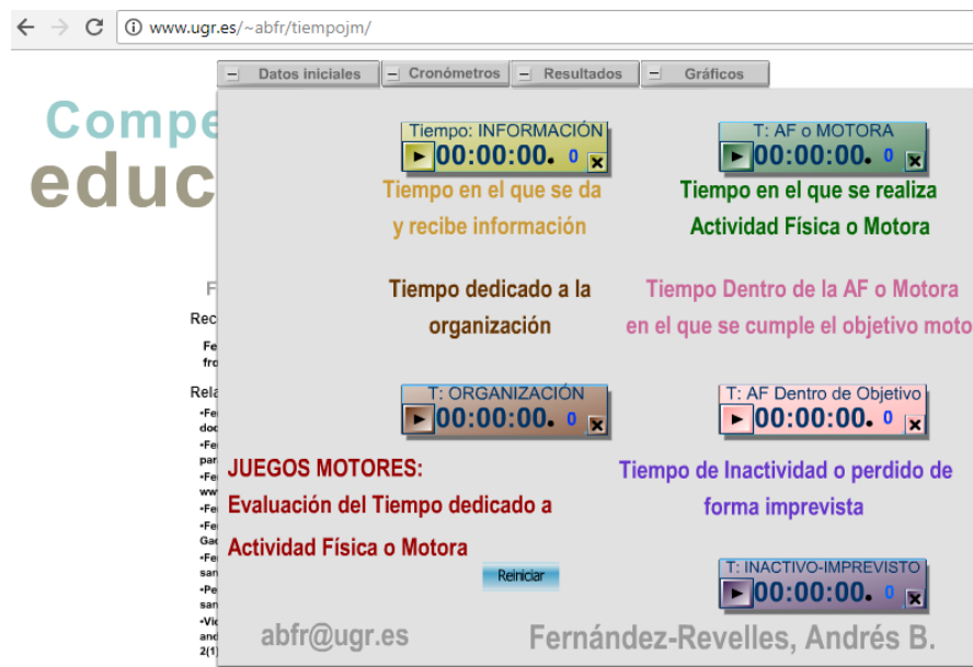
Figure 1. Application for the recording of time in motor games

By this method, the overall time of a session or of a motor game would be made up of the following times: