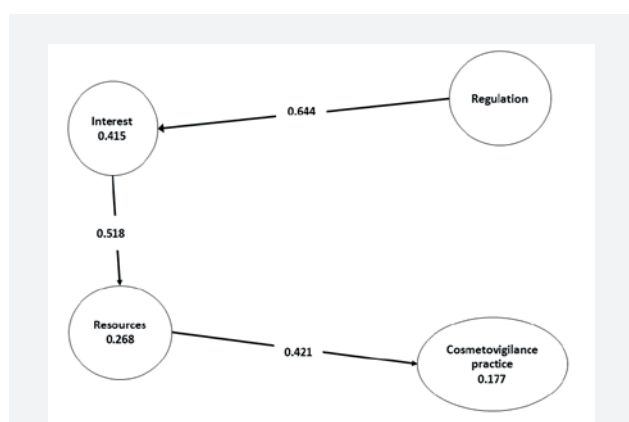
Figure 2. Research model tested

Considering the relation showed in figure 2, we evaluated the hypotheses proposed.