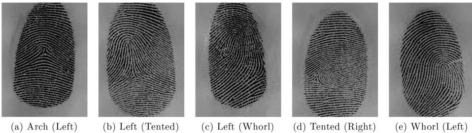
FIGURE 4 Some examples of fingerprints misclassified by the proposed network. The true class is shown in brackets

yielded by Hong's method is higher than with other extractors at the cost of a nonnegligible rejection rate.