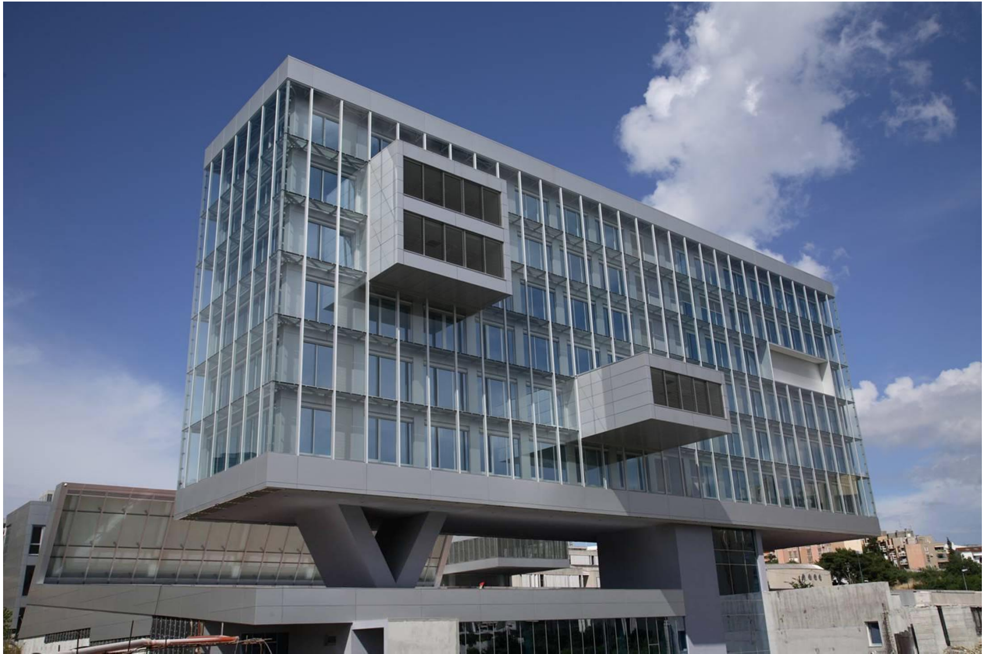
La Biblioteca de la Universidad de Split