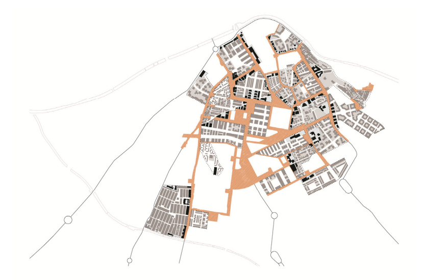
Figure 1. Intermediate space belonging to the southern growth of the city of Granada.

On one hand, the gradual growth of the south of the city of Granada, creates a sum of places that are also border spaces. They are as much geographical limits as they are social, cultural and even economic segregators.