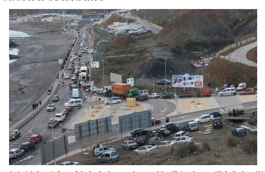
Figure 3. Aerial photo in front of the border between Ceuta and Castillejos.