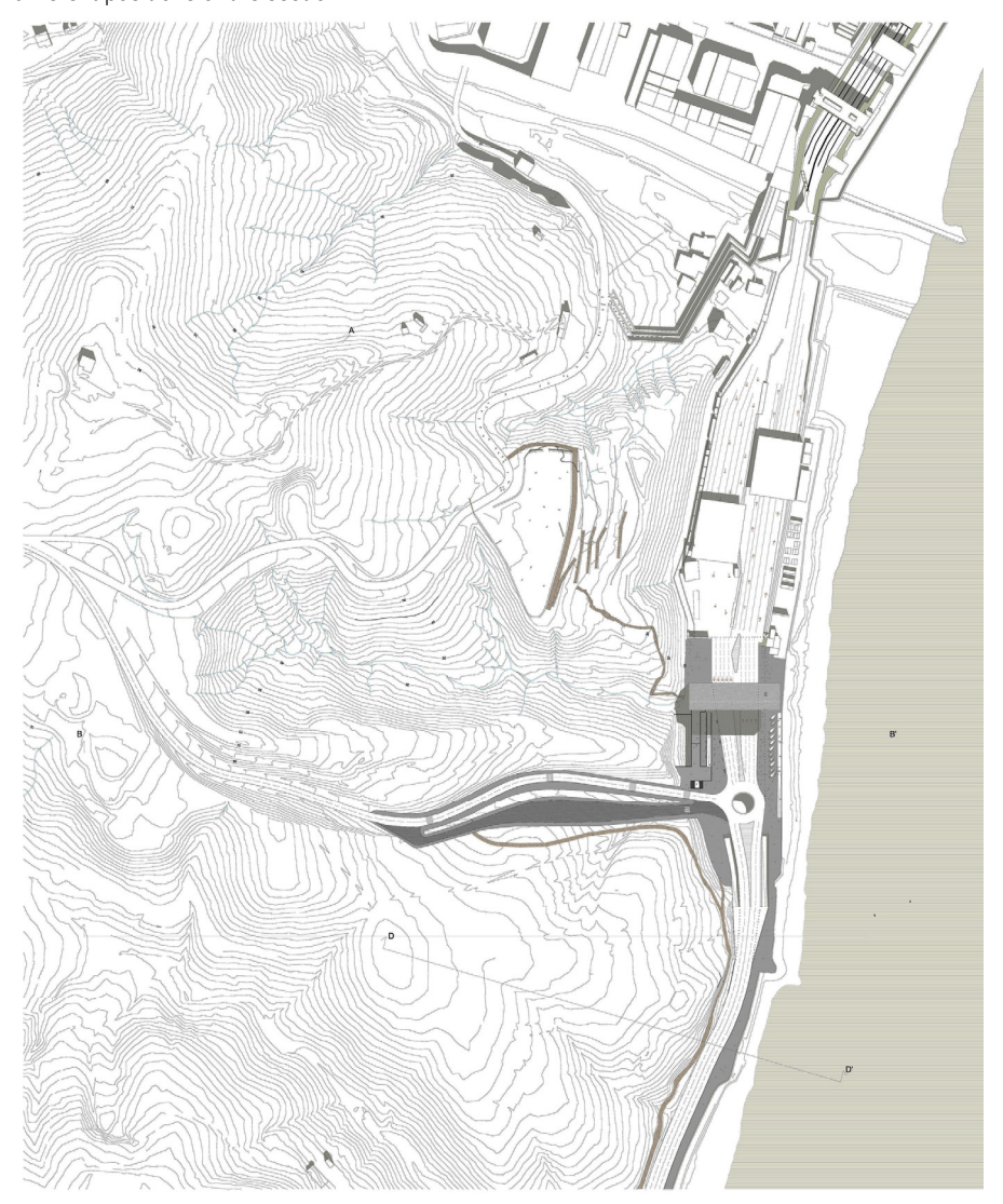
Figure 4. Intermodal space in the passage between Ceuta and Morocco.

Working on urbanizing in this context means to materialize the above approach and seek to respond to the different functions and flows that converge within it. In the developed project, we have tried to transform a space of transit and conflict into a place capable of articulating the concentration of social and economic dynamics, generating specific spaces for each function through a platform that naturally extends as an extension of the geographical slope. Thus, the complexity is taken over by an intricate architectural section in which the different types of flows are made possible and are integrating with the coastal landscape. A backdrop that unifies the different positions of the section.