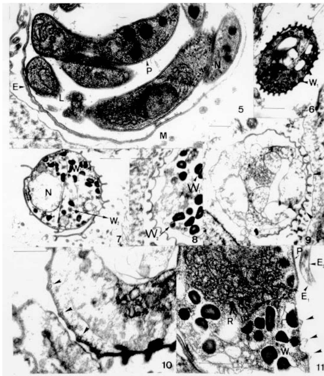
Fig. 5: portion of a mature type I meront. E: enveloping membranes with dense granular intermembrane material (arrow); L: longitudinal ridges in the pellicular merozoite membranes; M: microvilli; P: two membrane pellicle. Bar = 1 \mu m. Fig. 6: section through a macrogamont showing an undulated contour. Wall-forming bodies type I ( W_1 ) adheres to the periphery. Bar = 1 \mu m. Fig. 7: section through a macrogamont with an undulated contour. N: nucleus; W_1 : wall-forming body type I; W_2 : wall-forming body type II. Bar = 1 \mu m. Fig. 8: portion of a macrogamont fixed to an enterocyte showing an undulating contour in some zones. W_1 : wall-forming body type I; W_2 : wall-forming body type II. Bar = 1 \mu m. Fig. 9: free Cryptosporidium form in lumen intestine. Although its content is degenerated, the enveloping membranes are well preserved in a zone (arrows) showing a peculiar disposition. Bar = 1 \mu m. Fig. 10: portion of a macrogamont growing in an enterocyte. Microtubular structures (arrows) are evident. Bar = 0.769 \mu m. Fig. 11: portion of a macrogamont. Its enveloping membranes were accidentally displaced by sample processing, and some microtubules (arrow) are visible on the parasite pellicle. E_1 : enveloping membranes of the macrogamont; E_2 : enveloping membranes of other adjacent Cryptosporidium form; P: parasite pellicle; R: rough endoplasmic reticulum; W_1 : wall-forming body type I. Bar = 0.769 \mu m.