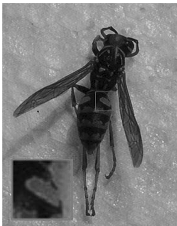
Figure 2 Photograph of the abdomen region of the wasp where the coloration values were taken.

greater the luminance (brightness) for that channel; for example, the coordinate 0, 0, 0 indicates black and 255, 255, 255 indicates white. Using the photographs, we also measured the length and width of the wasp abdomen, and the head width, using the program Image J [37]. Subsequently, the poison gland was removed from the wasp, and its diameter was measured three times, using the average of these three measurements in the analyses. For each case, all measurements were taken by the same researcher.