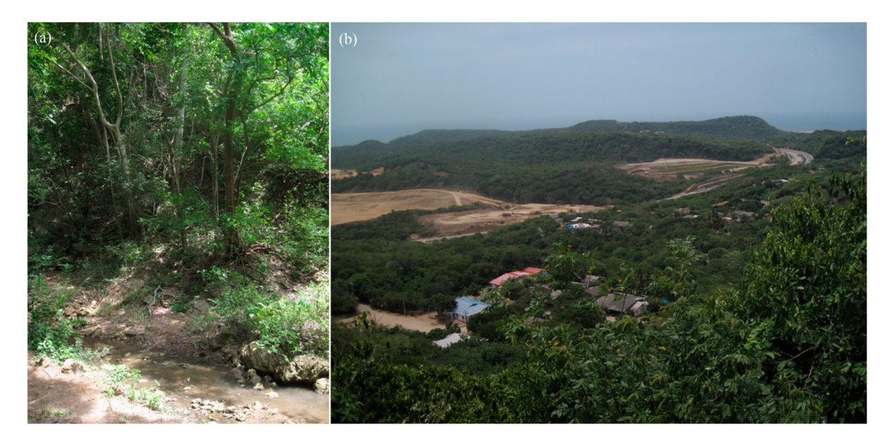
Figure 3. (a) Local spring in the tropical dry forest at the Cucamba drainage channel; and (b) Panoramic view of the village of El Morro. In the background, the Caribbean Sea, the coastal highway (90A), and on the left, the construction site of the Velamar gated community project (photos Schubert, July 2018).

A differentiation of areas covered by woody vegetation was rather rare. Vegetation areas were named forest or dry forest . Two groups differentiated between forest and woody vegetation along the coast naming them mangroves , and only one group used the class woodlands . Three groups differentiated between crops; in two groups up to 12 crops. Cropping areas were drawn mainly around the settlement areas Juaruco, El Morrito, and Bajo Ostión, which could be verified by the on-site field mapping. Only one group marked small-scale pasture areas. In addition, only one group included the projects Jwaeirruku and Velamar in their land use map, but to a significant minor extent. However, in discussion, all groups highlighted the negative consequences of the gated community projects such as deforestation and influencing the soil water balance (Figure 3). The explicit mention of the gated community projects in the discussion shows that the participants perceive them as the major threat to the village community.