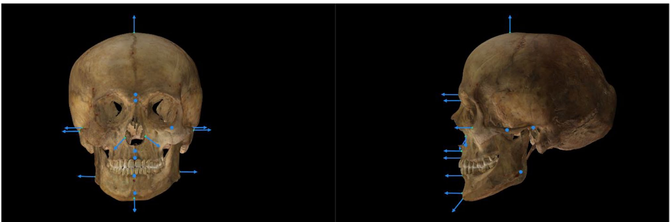
Fig. 5 Representation of the soft tissue direction through a directional vector for each craniometric landmark in a skull 3D model in frontal and lateral view

The results of this analysis are reported in Table 7 for the different degrees of support.