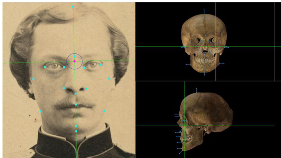
Fig. 1 Cephalometric (left) and craniometric (right) landmark location using the tools provided by Skeleton-ID™

The SFOs obtained in Skeleton-ID follow the pinhole camera model, which mathematically represents the essential behavior of any camera system [24, 25], including the early cameras available in the 1860s, and thus is considered suited for this study. The skull is displayed the same way it would appear in an actual photograph; in particular, perspective distortion is applied accordingly. The matching of the perspective was achieved by either the automatic SFO algorithm directly or through refinement by the analysts using an extensive trial-and-error process. The matching of the landmarks, the overall shape of the skull and face, and the consistency of corresponding anatomical features are considered while doing so. It is worth mentioning that Skeleton-ID offers a perspective adjustment tool, which allows the user to conveniently change the amount of perspective distortion. This is obtained using the so-called dolly zoom, i.e., moving the camera closer and while zooming out so that the skull is kept in the same apparent position and size.