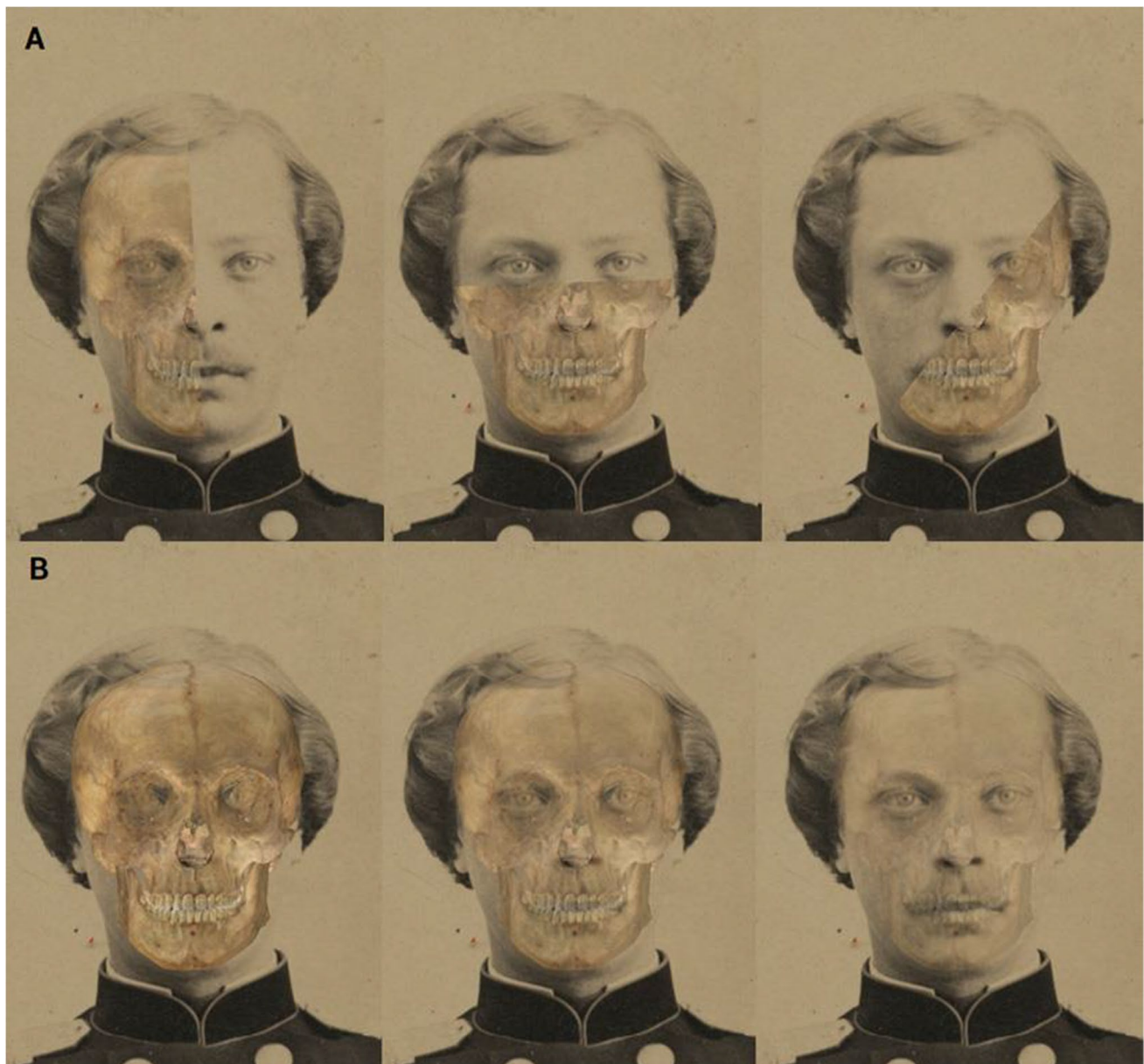
Fig. 3 Evaluation of morphological correspondence of the skull and the face on a SFO using Skeleton-ID™. A Visual assessment using the wipe tool (vertical, horizontal, and diagonal). B Visual assessment using the transparency/opacity tool (75%, 50%, and 25%)