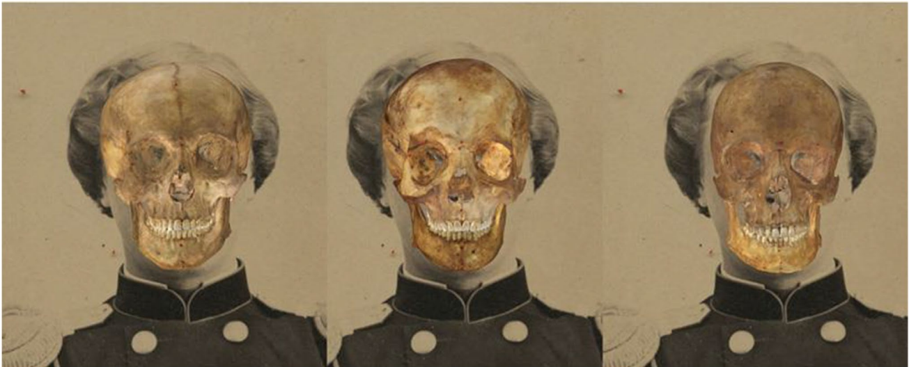
Fig. 2 SFOs belonging to three different skulls over the same photograph, all obtained using the POSEST-SFO automatic algorithm