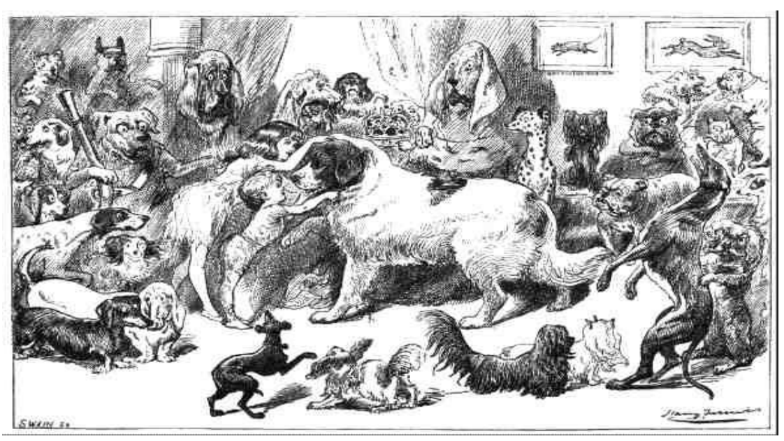
Illustration 2. Furniss, Harry. Drawing of the court in Dogland. 1889 (S&B, 341)

The image depicted here is clearly a representation of the highest stratum of society whose members are animalized. This constitutes the uncrowning of upper-class people, since all of them are represented by dogs of all breeds. Furthermore, the debunking of these characters goes further than the mere representation of the king as a dog. When Sylvie and Bruno want to leave the land, Nero offers to escort them until they reach the frontier of Dogland. This occasion serves for Nero to ask them a favour: "(W)ould you mind the trouble of just throwing that stick for me to fetch?" (S&B, 343). Later, Bruno orders him: "Beg for it' [...] and His Majesty begged. 'Paw!' commanded Sylvie; and His Majesty gave his paw" (S&B, 343). By acting this way, Nero is debunking his figure as a king by being at the orders of two children. This game played by the King and the children illustrate the abuse and thrashing presented also in the extract of the beggar. A similar example is analyzed by Bakhtin in Rabelais's work when Pantagruel visits the island of the Catchpole, whose habitants "earn their living by letting themselves be thrashed" (Bakthin, 196). Although not such a violent image as the one described by Rabelais, where the inhabitants are battered almost to death,