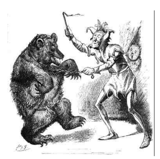
Illustration 3. Furniss, Harry. Drawing of the Jester and the bear. 1889. ( S&B , 131)

carnivalesque text. In Sylvie and Bruno and Sylvie and Bruno Concluded , Lewis Carroll similarly uses different ways of subversion, such as the physical transformation of some characters. In Sylvie and Bruno the chapter entitled "A Jester and a Bear" shows the disguise played by both characters Tabikat and Sibimet. In this chapter Tabikat dresses herself as a bear and Sibimet as a jester with a "cap and bells, and the rest of the Fool's dress" ( S&B , 312) (see illustration 3).