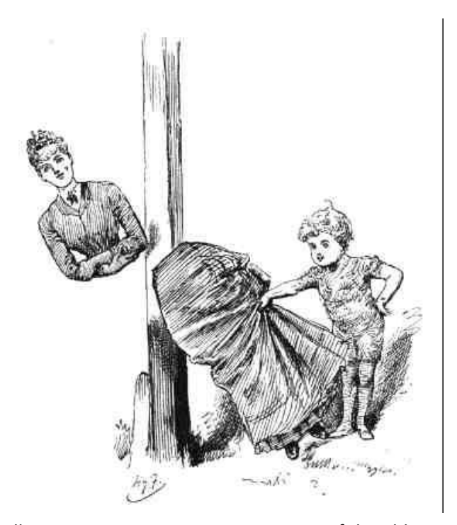
Illustration 4. Furniss, Harry. Drawing of the phlizz being destroyed. 1893 ( S&B , 394)

even move. It is made out of air and can