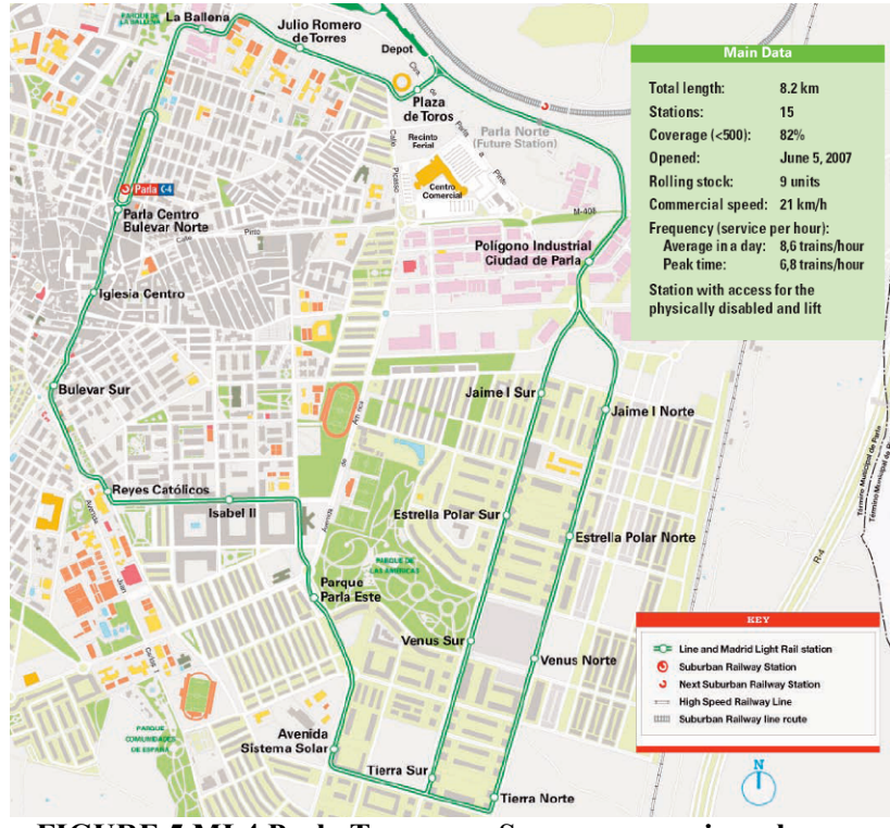
FIGURE 5 ML4 Parla Tramway.