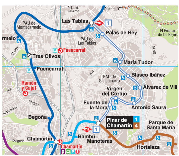
FIGURE 3 ML1 Pinar de Chamartin – Las Tablas.