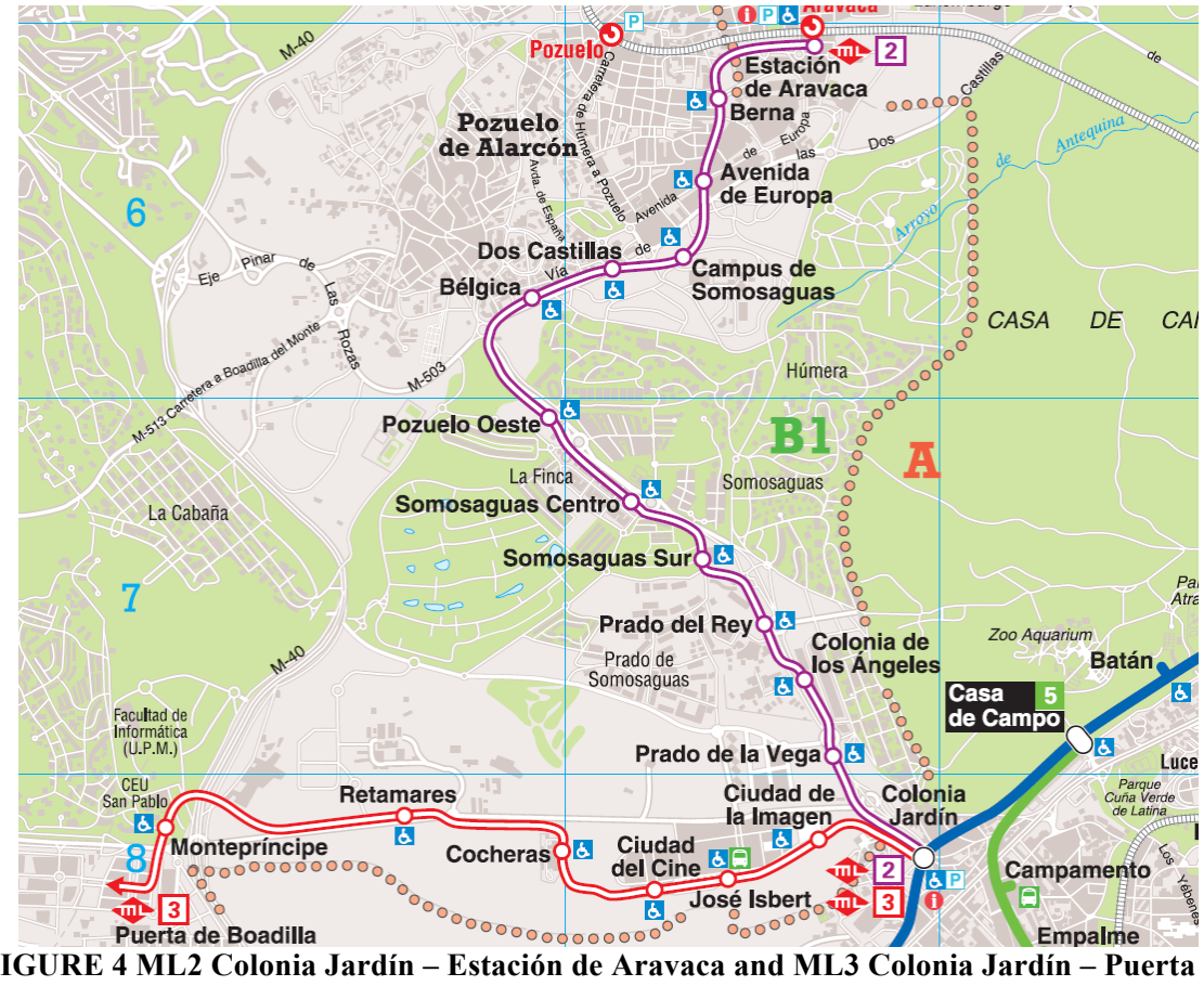
FIGURE 4 ML2 Colonia Jardín – Estación de Aravaca and ML3 Colonia Jardín – Puerta de Boadilla.