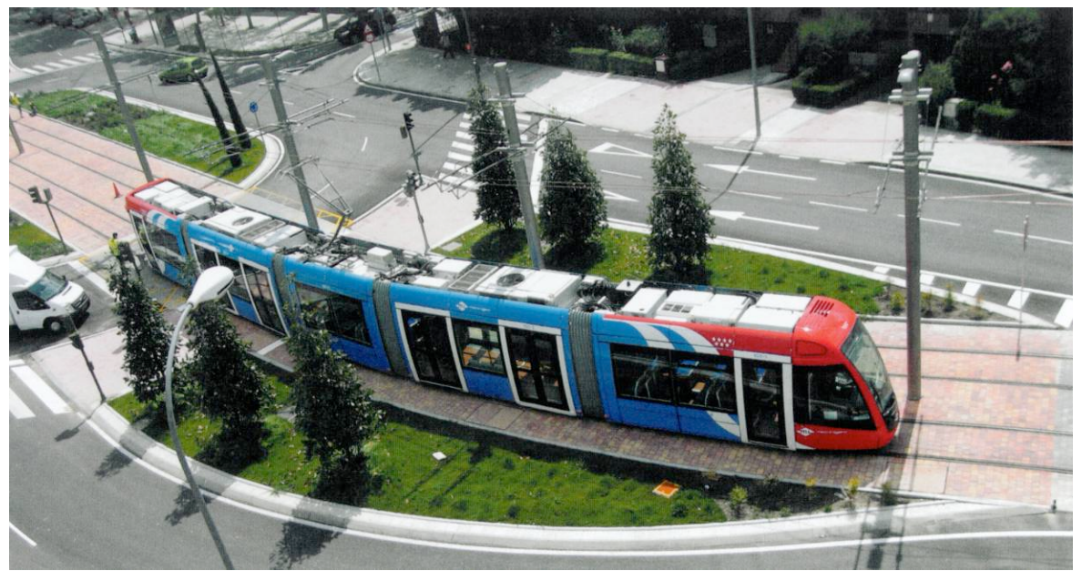
FIGURE 1 Example of urban integration and LRT vehicle in Madrid region