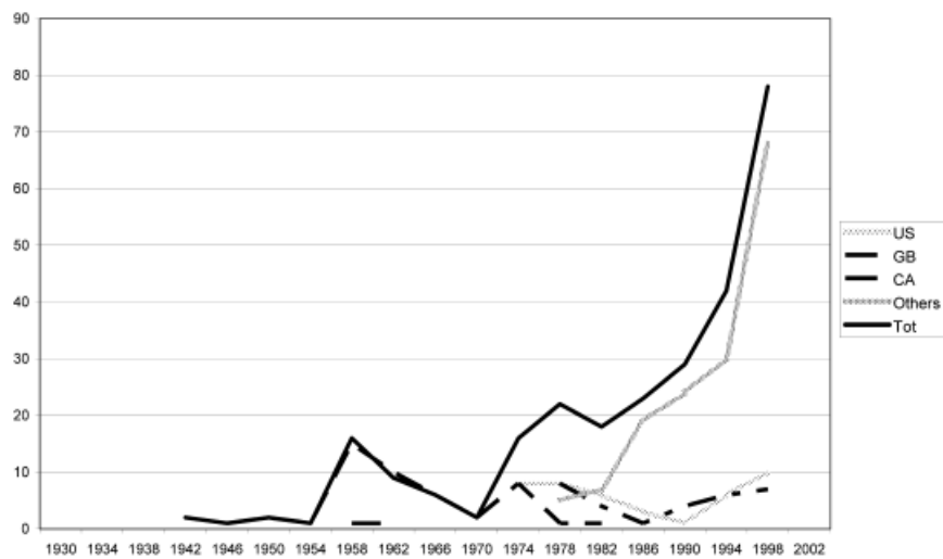
Graph. 2. Number of issued patents including the word «isotope production» (1930-2002)

Source: European Patent Office, see n. 6.