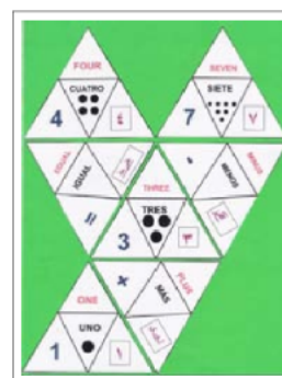
Figure 3: Example of a board with multiple operations

We think it is important that the child be able to transfer the basic operations into different languages and recognise the numbers in these languages. This provides the students with a fun way to reinforce their mastery of these operations and shows them how to use them to solve simple problems.