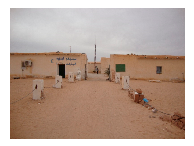
Figure 4. Regional hospital at the wilaya Awsard.