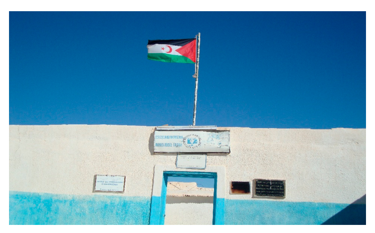
Figure 3. Abdel-Fatah School of Nursing.

A lecture room building was constructed in 2010, financed by Grupo CIVICA, a construction company from Alicante, Spain, with support from the University of Alicante in terms of materials and other contributions. The new building allowed the school to offer a greater number of places to students, as well as separate the teaching area from the residential and rest area. This led to a substantial improvement in the quality of the teaching and training, as well as in the living conditions of the teaching staff and students (Figure 3).