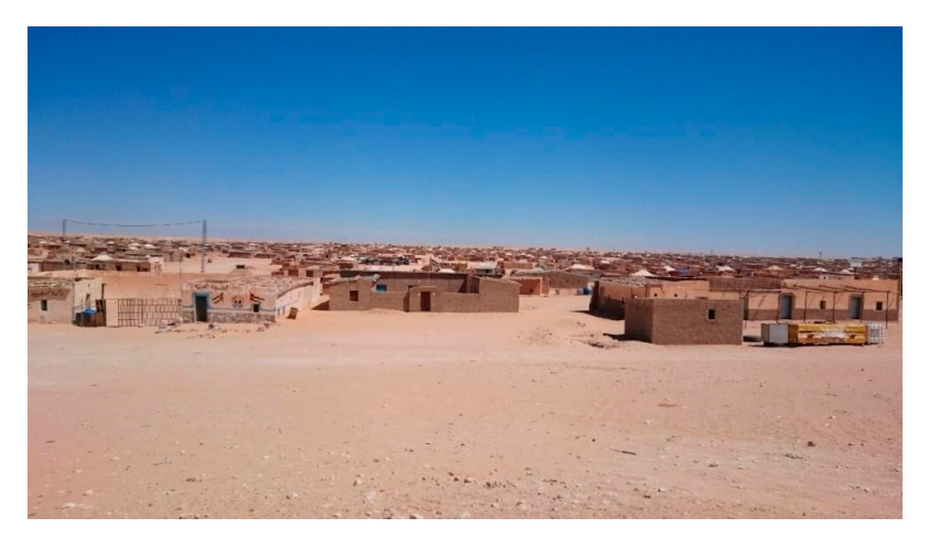
Figure 2. One of the Sahrawi refugee camp.

This paper is a result of the project of international development cooperation and its contribution to the improvement of the Sahrawi population's quality of life through institutionally strengthening the University of Tifariti [8]. It was funded by the Andalusian Agency for International Development Cooperation (Spain), and carried out by the University of Jaén during 2014–2018 at the Sahrawi refugee camps. This project analyzed the situation at the Ahmed Abdel-Fatah School of Nursing with the aim of contributing to its improvement.