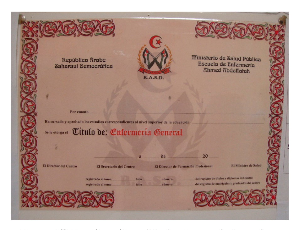
Figure 5. Official certificate of General Nursing.

Once the students have completed their training and received their degree certificate (Figure 5), the school sends a list of the graduates to the Ministry of Public Health, which places them in hospitals as required.