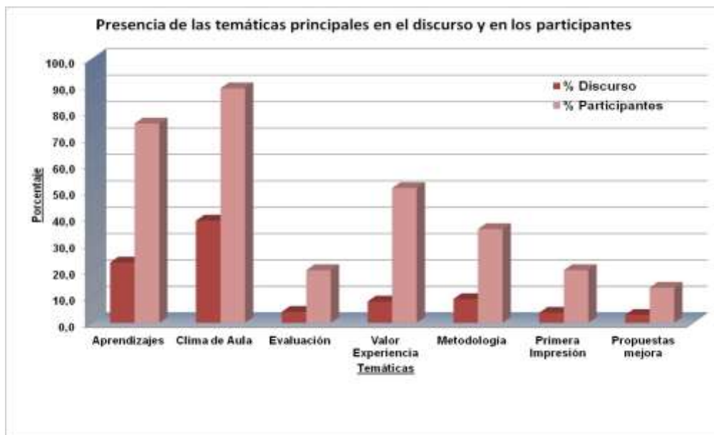
Graph 1. Presence of the main subjects in the discourse and by the participants