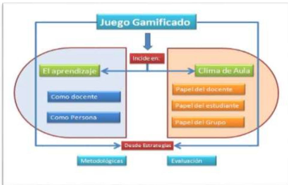
Figure 4. Theoretical explanatory conceptual map.

The compression of the phenomenon was carried out by qualitative methodology (Stake, 1995). Strauss and Corbin (2002) identified the value of this methodology not only to generate theory but also in grounding it in the data. In our case this was the meaning of learning from the gamification experiment as it was experienced. The information produced is analyzed from grounded theory because by basing it on the data it is more likely to generate knowledge, increase understanding and provide a meaningful guide to action (Strauss and Corbin, 2002).