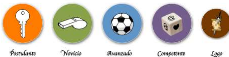
Figure 3. Badge models (tin plate).

Physical rewards indicate the level reached by each player during the adventure. The badge used in 'The Prophecy of the Chosen Ones' is made of tin plate (Figure III) with a different image for each of the 4 existing levels. In addition, the sublevels are represented by a smaller plate with the game logo.