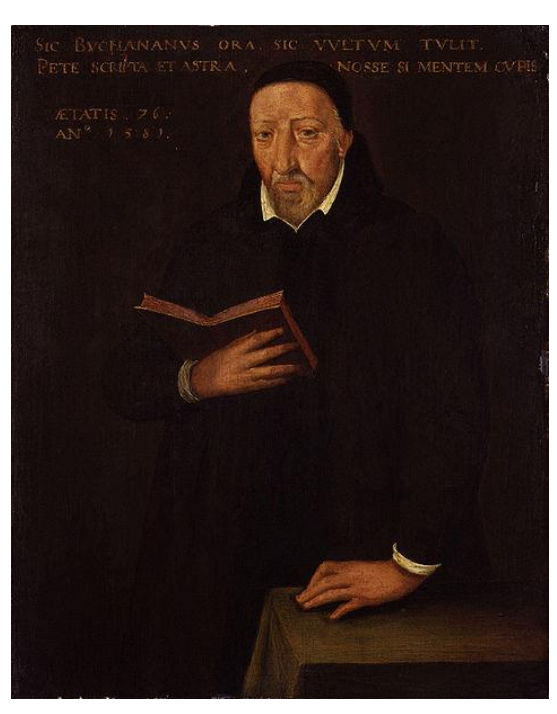
George Buchanan in 1581

There are important parallelisms between certain types of Protestant doctrines and the political ideas that circulated at the time. One of the most important debates was about the legitimacy of monarchs. Radical Protestants thought that an "ungodly monarch" (i.e. one who was not a Protestant) was illegitimate, and could thus be deposed by the people: this is the