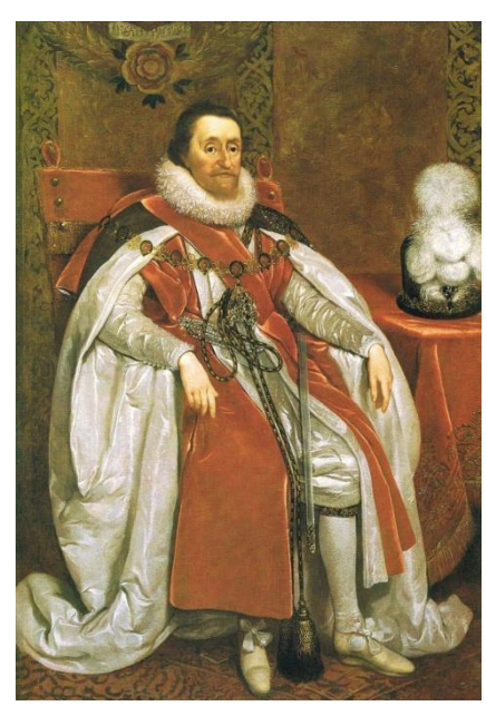
King James I

The reasons for the universal respect for this version vary enormously. Some admire its resonant prose, which sometimes has the rhythms of poetry... Others travel beyond admiration to reverence, especially if they believe that, as the translators asked in their prayers, God guided the translation.