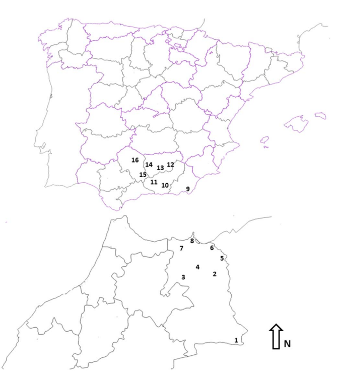
Fig. 1. Map of the study area in East Morocco and the East Andalusian territories used for bibliographical comparison. Numbers 1–8: main localities for the field study. 1. Figuig, 2. Yerada, 3. Guercif, 4. Taourirt, 5. Oujda, 6. Berkhane, 7. Driouch, 8. Nador. Numbers 9–16: Andalusian territories for bibliographical comparison. 9. Martínez-Lirola (1993), 10. González-Tejero, 1989, 11. Benítez (2009), 12. Fernández-Ocaña (2000), 13. Guzmán-Tirado (1997), 14. Casado-Ponce (2003), 15. Triano et al. (1998), 16. Galán-Soldevilla (1993).

Our first hypothesis is that due to the historical past and the centuries of shared culture and language, as well as a similar flora and vegetation, there must be a high overlap in plant use between these