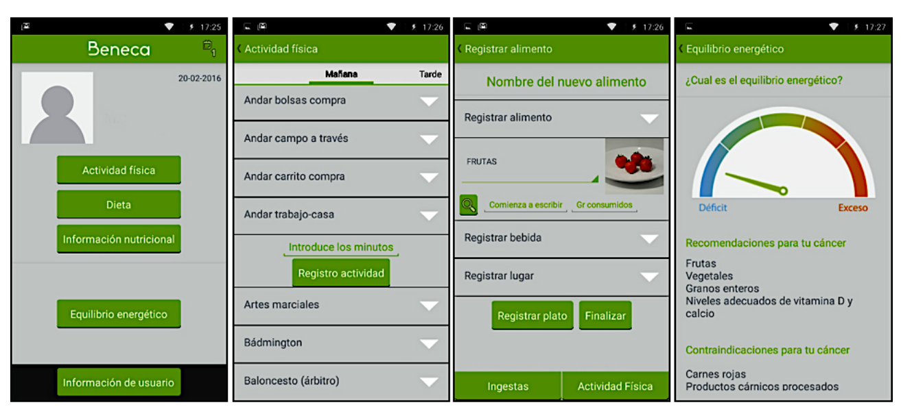
Figure 1. Screenshots of the Energy Balance on Cancer (BENECA) mobile health system.

The BENECA mHealth system was created from the validated Spanish version of the Minnesota Leisure-time Physical Activity Questionnaire [39]. The patients can record the activities completed during the day (intensity and duration), from 3 possible time periods (morning, afternoon, and evening). BENECA only records those activities that have a duration of at least 10 minutes. Internally, the app assigns a metabolic equivalent value (MET) to each activity based on the Compendium of Physical Activities [40].