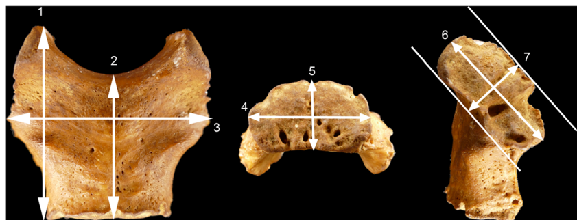
Fig. 1 The locations of the measurements on the pars basilaris

The results obtained for the validation of the methods proposed by Fazekas and Kósa [7] and by Scheuer and McLaughlin [8] are shown in Table 3. Significant