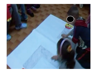
Figure 9 . Children touching the entire drawn road with their open hand, as in a simulated travel

Children's verbal descriptions are quite poor (besides the indication of curves, only deictic terms), and can be understood only considering the co-timed gestures; the teacher uses then a trick to push them to elaborate more elaborated descriptions.