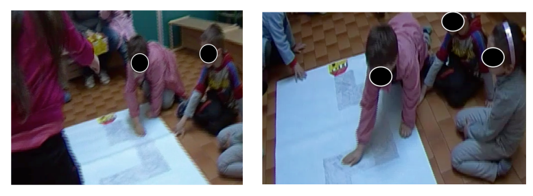
Figure 8 . Stefano is "travelling" with his hand on the drawn road, before and after a "curve"

Now, asked to describe the road (line 10), children provide a dynamic description , apparent in their words, but particularly in their gestures. We see for instance here Stefano, who is travelling the road with his hand (Figure 8) to indicate the "curves" that he mentions; but also other children are pointing to the road moving their hands to imitate turns—see the girl who stands in Figure 8 (left image); other children touch the entire path with their hands , without making any verbal comment (Figure 9); or Francesca that is showing with her hand the meaning of the word "straight" (line 12).