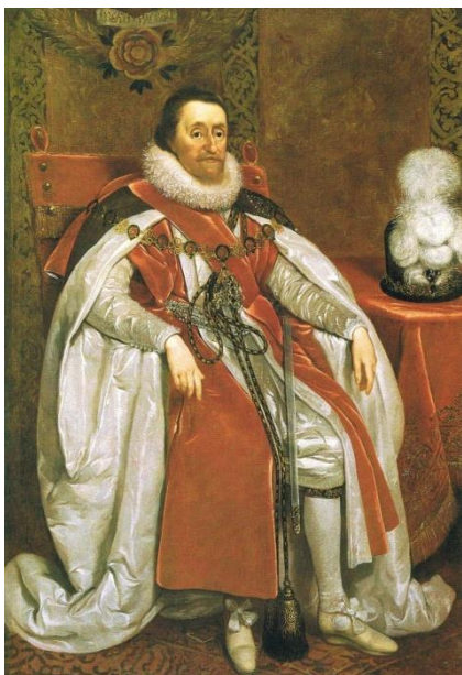
King James I

In addition to this printing history, the KJV also has a political, ecclesiastical, and cultural history, for in the course of its long life it has been championed by various confessional groups, as well as by those whose interest is its literary style and influence. The monarch whose name it bears was an active participant in debates about the structure of organized Christianity in the post-Reformation period. He firmly rejected the presbyterianism practised by many of his Scottish subjects, opting instead for the episcopally led Church of England and expressing that preference with admirable succinctness: 'No bishop, no king'. This was a sharp rebuke to England's hotter Protestants, the puritans who rejected bishops as a relic of popery. Some puritans also initially mistrusted the KJV, though it duly came to be central to the lives and witness of their evangelical heirs throughout the English-speaking world.