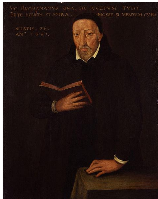
George Buchanan in 1581

See the following definition: “Presbyterianism, system of church polity, occupying a middle position between episcopacy and congregationalism. Its organization is administered by representative courts, composed of clerical and lay presbyters of equal status, divided, according to their functions, into ministers and ruling elders. Such polity may be found throughout the history of the Christian church, but its modern movement is primarily attributed to the doctrine of Calvin. In its simple form of worship, the Bible is considered the sole rule of faith and conduct, the two sacraments being baptism and the Lord's Supper. ” 2 In the early Church, a presbyter was the administrator, and leader of a local congregation.