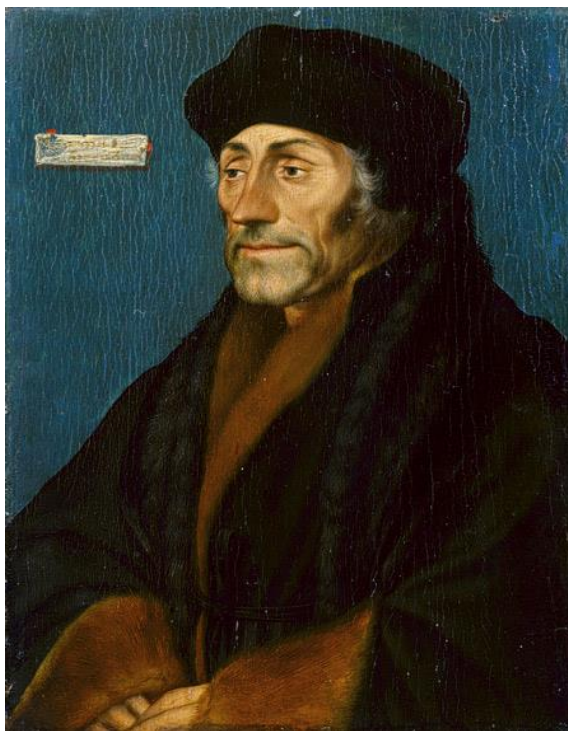
Erasmus, by Hans Holbein

As mentioned above, the KJV was not the first translation of the Bible into English. The scholars that worked under the influence of Wyclif (see unit 3) in the 14th and 15th centuries had already translated part of the Bible into Middle English. And in the early 16th century a new school of Bible translators grew under the combined influence of Luther's plan to popularize the word of God and make it available for the common believer, on the one hand, and on the other the new techniques for textual and linguistic analysis developed by philology. One of the main aims of philology in the 15th and 16th centuries was to recover those texts that had been lost during the Middle Ages (in particular, Latin and Greek texts from classical antiquity), and to produce new versions, free from the textual corruption accumulated over the course of their manuscript transmission during the Middle Ages. These techniques could be used to authenticate texts, and to identify later additions, and even counterfeits. Applying the principles of philological analysis to the texts of the Bible was a revolutionary approach which, hand in hand with the new translations of scripture into the different vernaculars, had a tremendous social, political, and religious impact. The following text talks about William Tyndale, the first translator of the Gospel into early modern English.