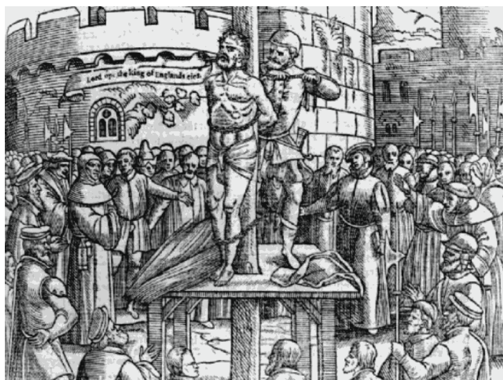
The execution of William Tyndale, outside Vilvorde Castle, in the Netherlands, October 1536.

Within this frame of mind, a translator that facilitated popular access to previously forbidden knowledge could have the aura of a liberator. In fact, during the Reformation, many translators suffered persecution, and not a few of them were executed. Fray Luis de León in Spain was thrown in jail for (among other reasons) translating the Song of Solomon into Spanish. The Spanish Protestant Francisco de Enzinas, who produced the first translation of the Gospel into Spanish, had to spend most of his life in European exile. William Tyndale, the first translator of the Gospel into modern English was executed in the Netherlands for rendering the Bible into English. And these are just a few examples.