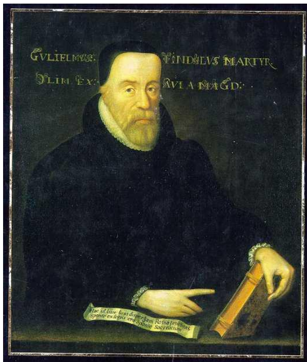
William Tyndale, proudly showing off his greatest achievement, the first translation of the Gospel into modern English

he began to print the New Testament in the Catholic city of Cologne, but, when the printing house was raided by the authorities, Tyndale fled [...].