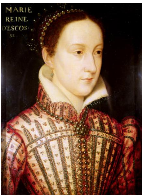
Mary Stuart, Queen of Scotland between 1542 and 1567, and mother of James I. Her deposition prompted James Buchanan to compose his volume on the law that regulated the monarchy in Scotland

“ Buchanan attempted, in the De Jure, to deal with the fundamental question at stake in the Controversy [i.e. the controversy following the forced abdication of Mary Queen of Scots, the mother of James I, who was forced to abdicate in favour of her son after a rebellion]. That question was: had the people of Scotland the right to call their rulers to account for their public