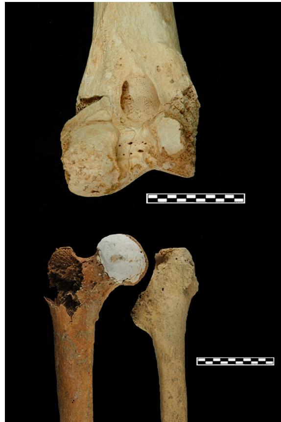
Fig. 3. Settlement of Castellón Alto (Galera, Granada). Upper Case 1, 35-39 years-old male, burial n.º 112: Detail of the popliteal or Baker's cyst of right distal epiphysis. Down. Case 2, 41-60 years-old female, burial n.º 30: Detail of femoral proximal epiphysis in anterior view.

to the other lesions, since the thigh must have been very large, obliging him to walk with his foot turned inwards. This position of his lower limb and his upper extremity muscle development suggests that this man walked with the aid of crutches or sticks. The right femur shows a popliteal or Baker's cyst (Fig. 3 upper). A Baker's cyst can be caused by herniation of the knee joint capsule to the back of the knee. This commonly occurs with a tear in the meniscal cartilage of the knee and is related to a trauma (Johnson et al. 1997). A large cyst may cause some discomfort or stiffness but generally has no other symptoms. This lesion may be the result of overloading the right leg while walking.