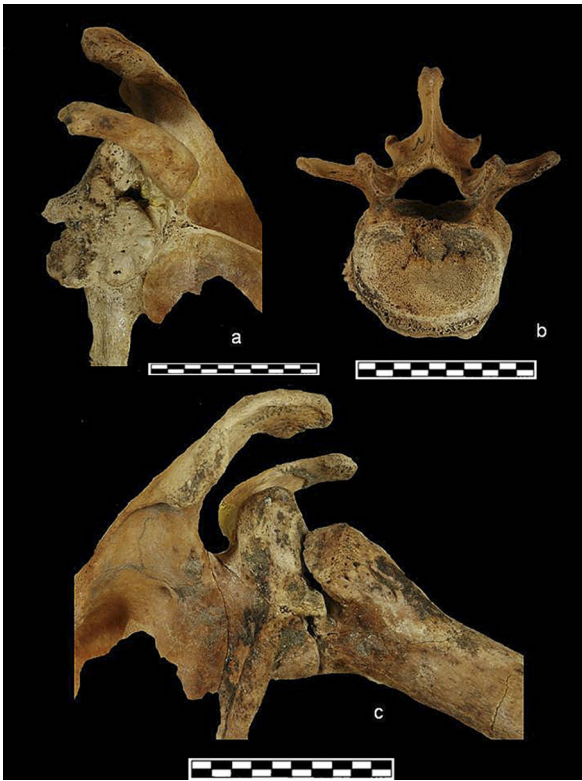
Fig. 5. Settlement of La Terrera del Reloj (Dehesa de Guadix, Granada). Case 3, 24 years-old male, burial n.º 2: a. Right scapula in anterior view; b. Lumbar vertebra with disc herniation and mild degenerative joint disease; c. Right humero-scapular joint.

With the humerus in anterior position, the arm would remain at a distance of 15-20 cm from the trunk when at rest. Given the condition of the joint, abduction would be limited to little more than 60° and repropulsion and internal rotation movements would not be possible, although external rotation would be preserved (Kapandji 1984).