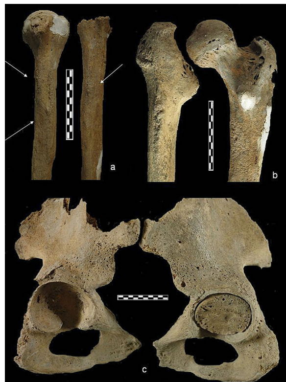
Fig. 4. Settlement of El Castellón Alto (Galera, Granada). Case 2, 41-60 years-old woman, burial n.º 30: a. Humeri. The arrows indicate muscular attachments; b. Femora. Detail of proximal epiphysis in posterior view; c. Coxae with left femoral head in acetabulum.

This skeleton was found in 1983 at La Terrera del Reloj site in Dehesas de Guadix (Granada)