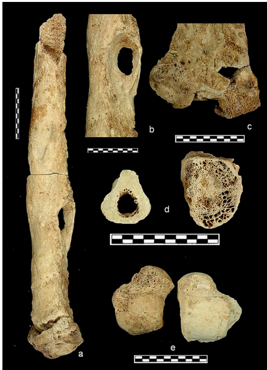
Fig. 2. Settlement of Castellón Alto (Galera, Granada). Case 1, 35-39 years-old male, burial n.º 112: a. Left femoral diaphysis, lateral view; b. Detail of left femoral diaphysis in posterior view; c. Detail of left distal epiphysis; d. Sections of normal right femur and of pathological left femur; e. Upper view from the tali.

He was a 35-39 year-old male with a medium degree of preservation and presents signs of strong muscle development in the upper extremities and weak development in the lower members (Al Oumaoui et al. 2004). He has two healed traumatismes in the ribs, mild osteoarthritis in the lumbar spine and Schmorl's nodes in L1, L2, L3 and L4. Lesions on the left femur could be attributed to osteomyelitis (Fig. 2a-d). X-ray studies revealed no signs of trauma in this femur, therefore the infection may have initiated in a soft tissue injury and reached the bone via the blood. A severe periostitis was detected on the left fibula and on preserved fragments of the tibia, which may indicate extension of the infection to the entire lower limb. Signs of severe osteoarthritis were observed in the left knee (Fig. 2c).