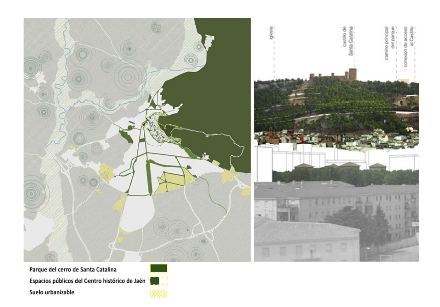
Fig. 2 Territorial dimension of park Cerro de Santa Catalina. Composition of historical layers.