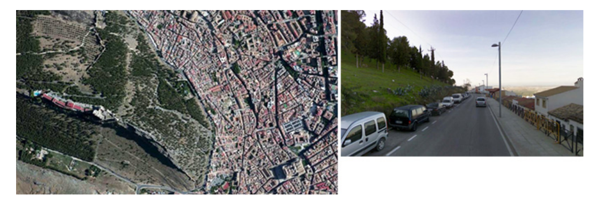
Fig. 1 Area of intervention. Image of "Paseo de Circunvalación" road.

This project investigates specific problems of the historic capillary network: the spacial and urban dimensions of infrastructure elements, like a highway bypass that severs urban relationships in a specific zone, the lack of symbolic conscience and a need for connection between a park and important elements of patrimony. But beyond these concrete circumstances, the possibility of constructing public or urban space as a multirelational system, the creation of internal territorial crossroads and the creation of multivalent functions that permit the friendly coexistence of urban, infrastructural and natural media is an argument for a methodological and disciplinary discussion that permits us to extrapolate solutions and study the conception of universal urban elements.