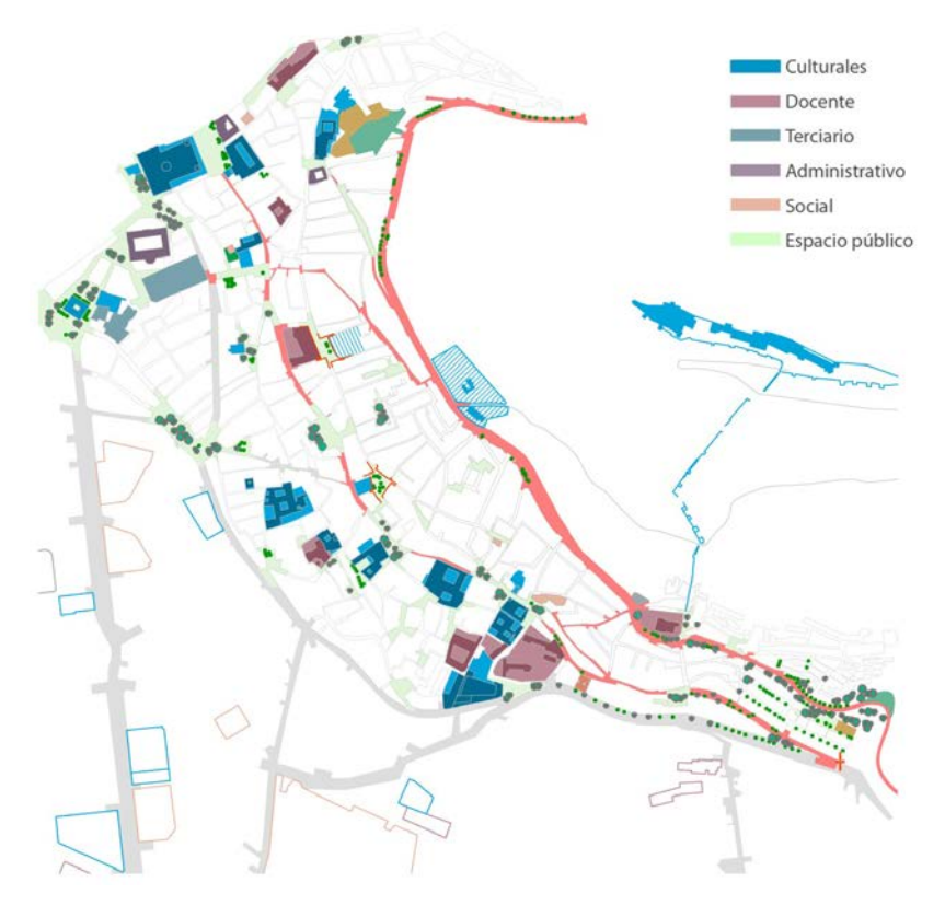
Fig. 2 Project of centrality within the neighborhood, condenser of activities and sociability. Craft market, community workshops and participatory spaces.