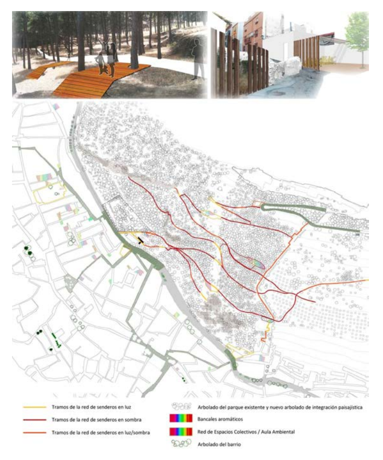
Fig. 6 Environmental network.

With respect to the park, the creation of pausing spaces, grading the surface, increasing the internal circulation through a network of paths that connect certain natural features of the hillside, the increase in the diversity of plants, spaces of light and shade, open and closed spaces, are consequences of the need to convert the hillside into a healthy, environmentally active and socially used space.