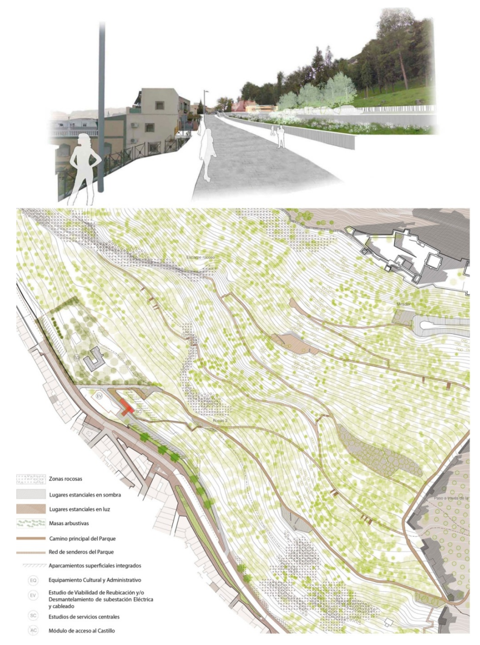
Fig. 3 Detailed cartography of the project area. Access to the park.

The future network of collective spaces, the asociation between historic neighborhoods and the Castle Hillside Park, the establishment of an intermitant Environmental Hall that connects both urban systems and strengthens the social relationsips, the creation of a new fiscal distribution in the planning field for these depressed central areas, or the conveting of the roadway infraestructure into a collective and symbolic space with greater spacial comfort and increased intermodality...these are some of the actions of the project that stand out.