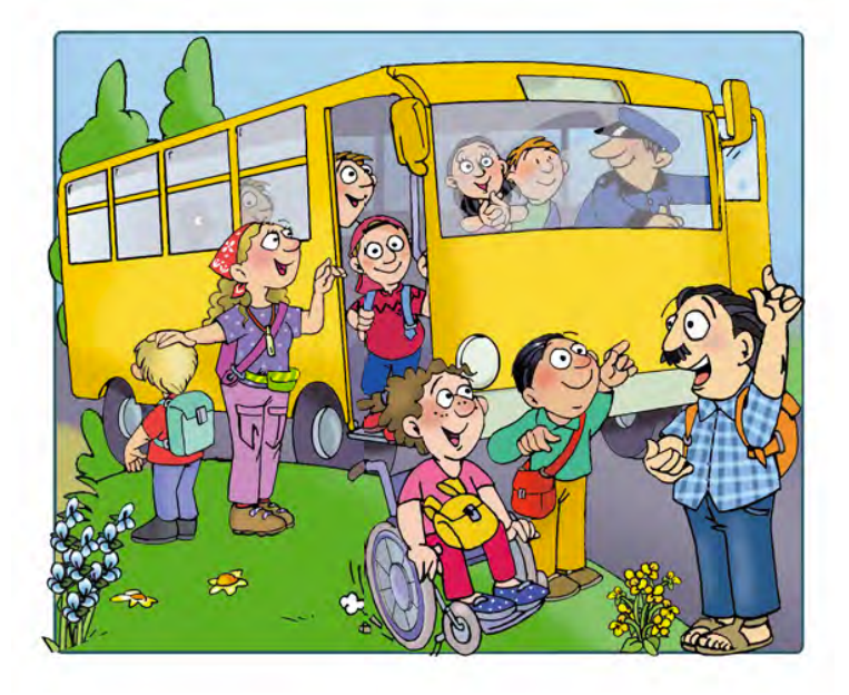
Figure 1. A handicaped student share with others a day in the field. Estrella Fages ©, Graciñas, VicenVives (2004). Digital illustration.

This document is a reflection on the role of the illustrator as supporter to the text and its commitment with the new values shared within society, which have to be promoted in educational centers, whose teachers also have to 'sign' this commitment with a suitable choice of the books and didactic materials that their pupils will use (Figure 1), and that will be, in a sense, their 'pedagogic commitment' with the families.