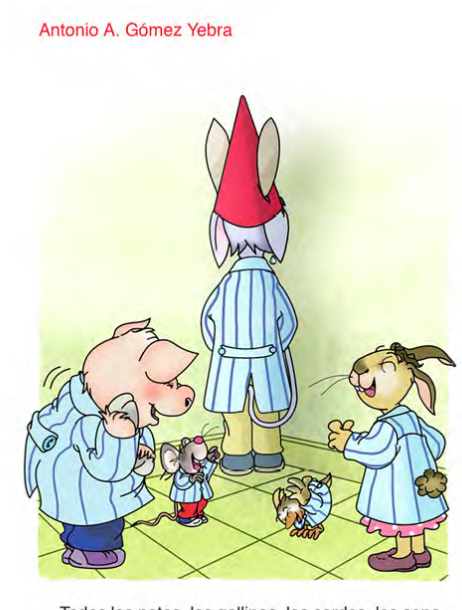
Todos los patos, las gallinas, los cerdos, los conejos, las palomas, los gorriones, y hasta los ratones se reían de mí cuando me quedaba castigado, mirando a la pared.

The skills that can be activated, on the other hand, by reading a story or a textbook - and its graphical support, which is really important in some cases -, such as the capacity of attention, imagination or the connection among facts and values (Gómez Couso, 1993) force the illustrator, in relation with the previous paragraph, to create a meticulous work in relation with the explicit or tacit values that their drawings could incorporate, and simultaneously promoting the development of the mentioned skills. And in many cases this is not easy at all.