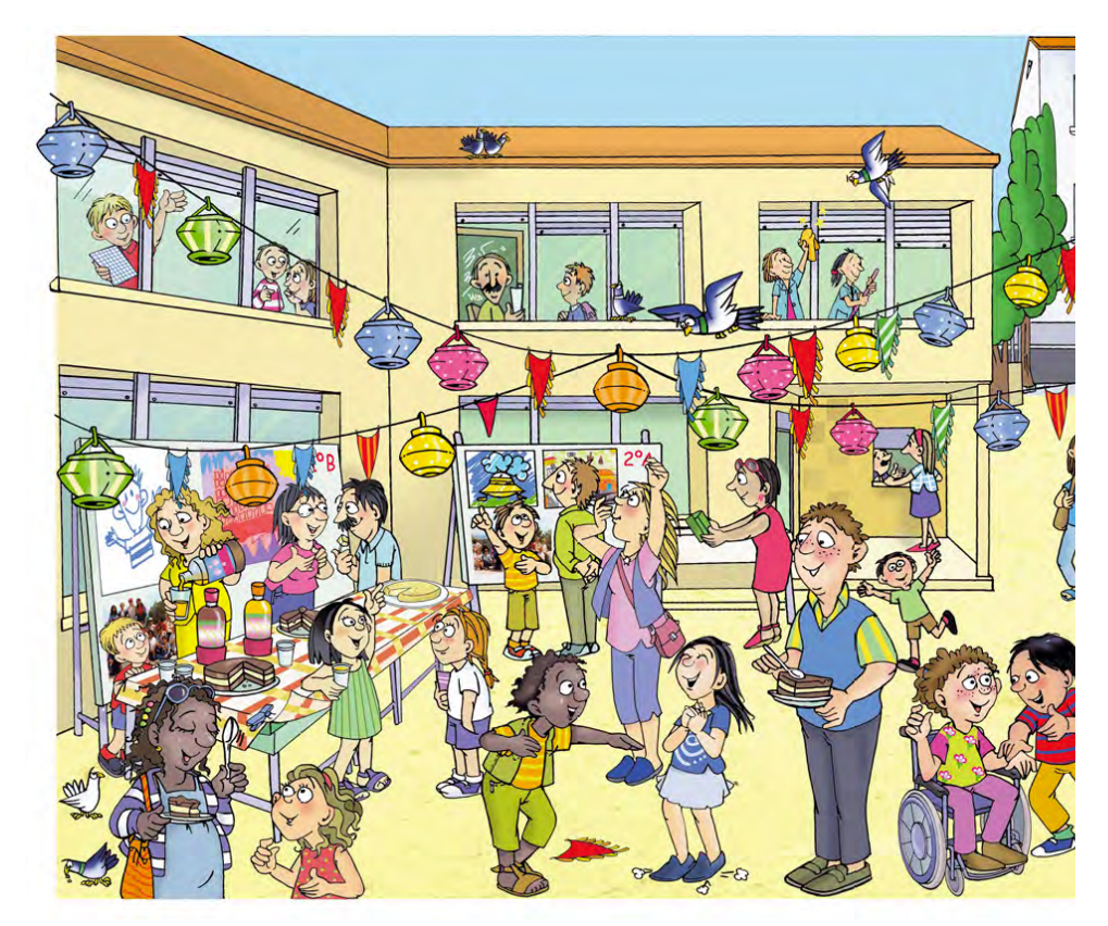
Figure 4. Diversity in the school. Estrella Fages © Vives Vives (2006). Digital illustration.

As interpreters of what the educational teams (authors) and editors present, illustrators must be creators (at least in part) of the tools that are in use in the classes and as such, they must have a personal commitment with those.