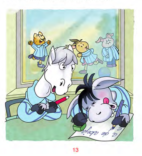
Figure 3. Estereotipes: smart horse/ donkey dumb. Estrella Fages © Mi amigo listo, Algaida (2010). Digital illustration.

Yo me sentaba en mi pupitre, él se ponía a mi lado, sin importarle no salir al patio, y me recordaba cada letra, como la había enseñado la profesora.